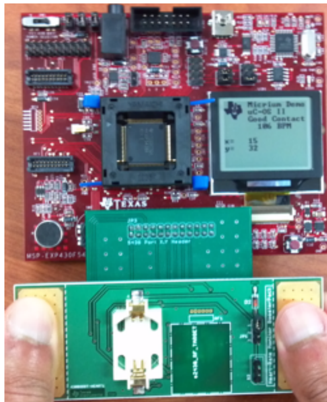
Figure 1. MSP-EXP430F5438 With HRM BoosterPack Hardware Setup

The Experimenter Board has a 2D accelerometer on board that provides X- and Y-dimension coordinates for tilt-sensing and other applications. This task also uses the integrated ADC to sample the X- and Y-dimension analog signals and display the resulting conversion values on the LCD.