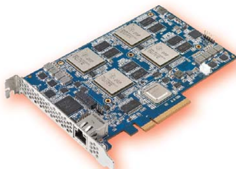
▲ Figure 1. Advantech DSPC-8681 full-length PCIe card with eight C6678 DSPs

Texas Instruments' multicore processors offer the high-performance processing capabilities that these applications require,