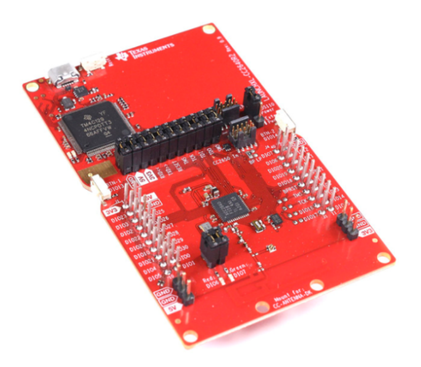
Figure 2. CC2640R2F LaunchPad Development Kit

The real secret to moving faster with Bluetooth 5 is getting started today. Whether you are designing a connected medical device, smart meter or motor condition monitor, Bluetooth 5 enables you to double your speed. With TI's fully qualified Bluetooth 5 protocol stack, you can rapidly start development today and have more time to innovate.