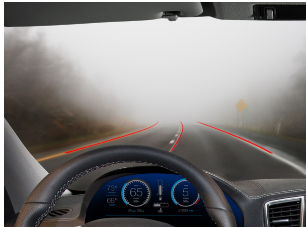
Figure 3. Aftermarket head-up display used to help see road ahead

within the user's FOV. The HUD could be used to highlight obstacles ahead even with low visibility given high fog coverage (Figure 3).