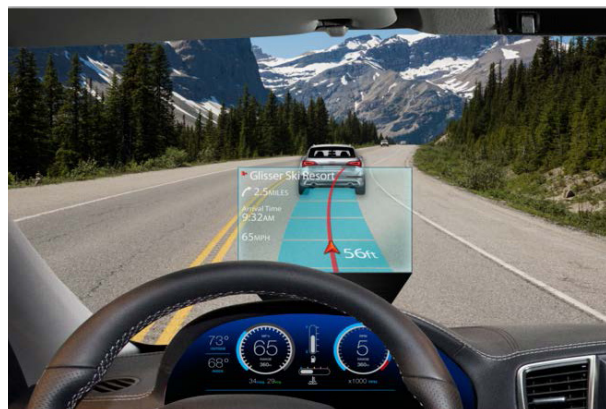
Figure 4. Aftermarket head-up display