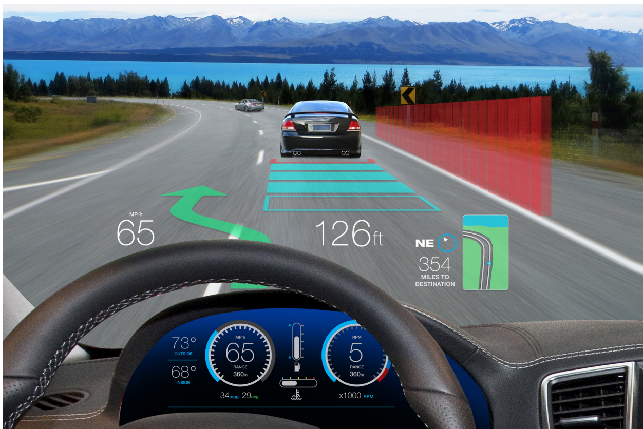
Figure 1. Example of an automotive DLP head-up display

This paper is written for individuals involved in new product development, with the objective of helping them make educated end-equipment decisions for aftermarket HUD design. The paper includes benefits, applications and display design considerations related to HUDs. The paper also covers DLP ® technology benefits and product selection for aftermarket HUDs. Refer to application note " TI DLP ® Pico ™ Technology for Aftermarket HUDs " for an explanation how a DLP head-up display works.