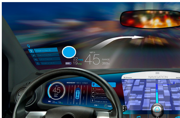
Figure 2. Head-up display indicating a right turn during navigation