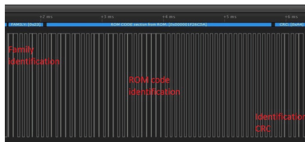
Figure 3. Single-Wire Reception of 64-bit Identification Number