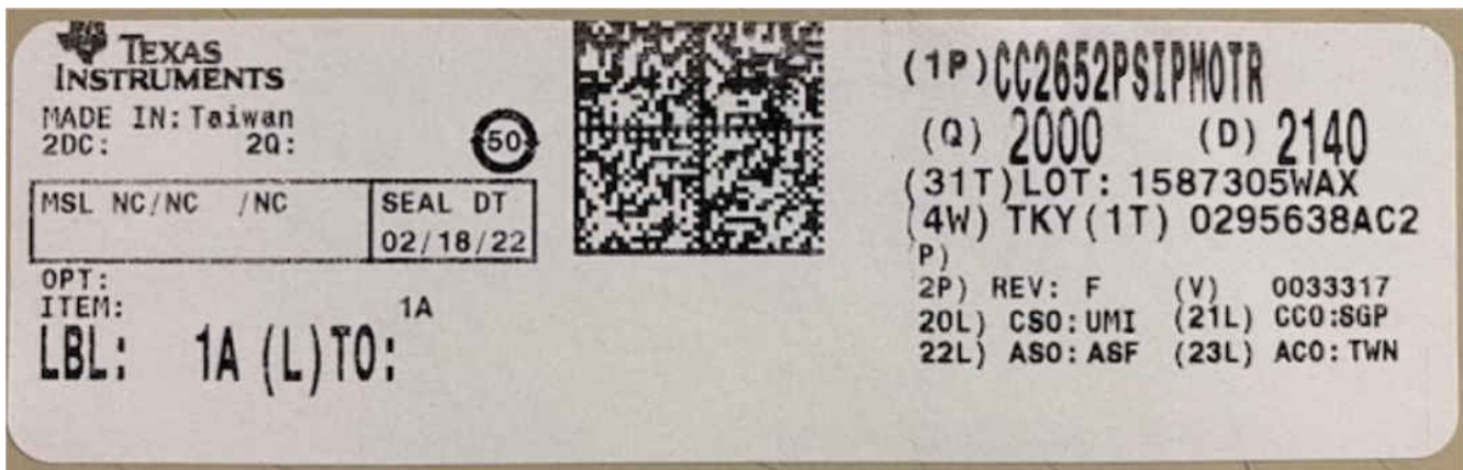
Figure 2-3. Sample Product Shipping Label for the CC2652PSIP Module