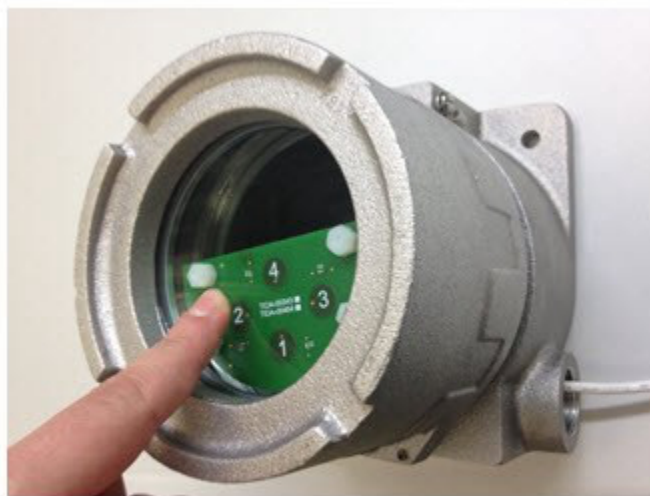
Figure 1: Touch through Glass Reference Designs

Our industrial customers struggle to find ways for plant operators to press buttons without having to open the enclosures, which can be time-consuming.