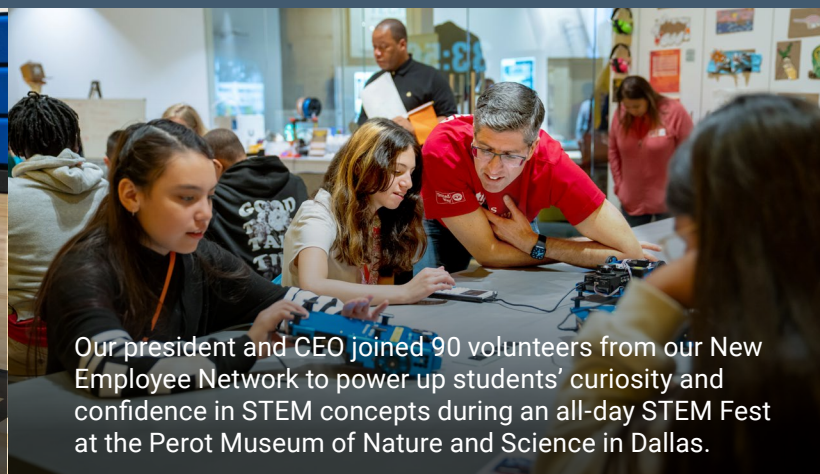
Our president and CEO joined 90 volunteers from our New Employee Network to power up students' curiosity and confidence in STEM concepts during an all-day STEM Fest at the Perot Museum of Nature and Science in Dallas.