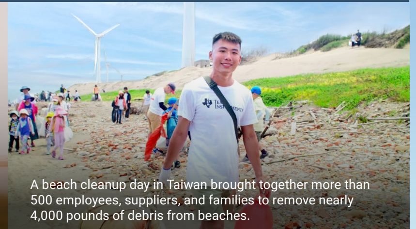
A beach cleanup day in Taiwan brought together more than 500 employees, suppliers, and families to remove nearly 4,000 pounds of debris from beaches.