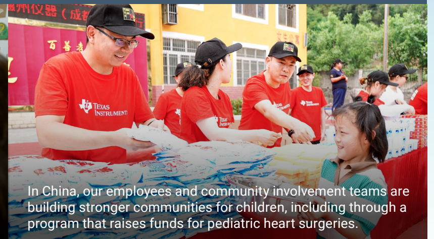
In China, our employees and community involvement teams are building stronger communities for children, including through a program that raises funds for pediatric heart surgeries.