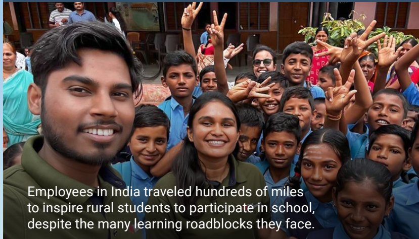
Employees in India traveled hundreds of miles to inspire rural students to participate in school, despite the many learning roadblocks they face.