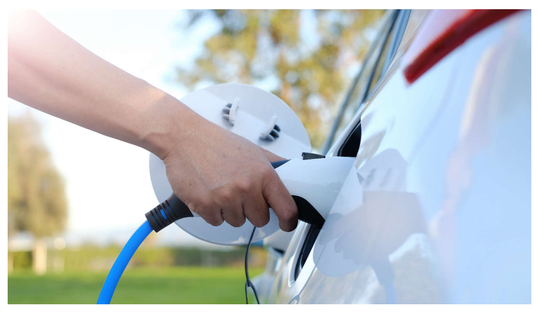
Figure 1. OBC Charging Gun

To detect the CC and CP signals, determine the normal status, and wake up the host MCU to control the charging process, some designs leverage discrete designs with transistors, resistors and capacitors. However, it can be difficult to make changes for different project requirements and can require different PCB sizes. Now, a user can leverage a MSPM0 MCU to design a lower-power and higher-scalability integrated OBC wake-up design.