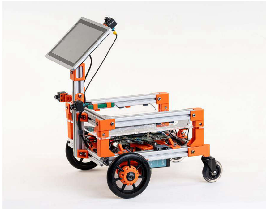
Figure 2. TechNexion “Rovybot” AMR Demo, ROVY-4VM-EVK With Chassis