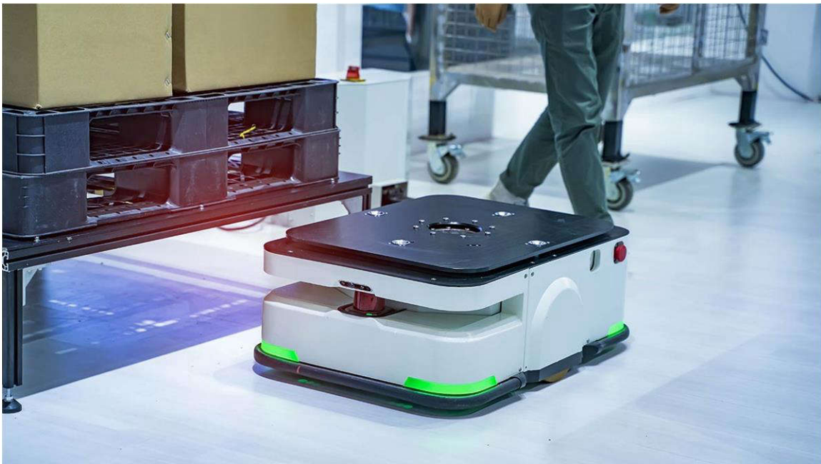
Figure 1. Autonomous Mobile Robot in a Warehouse Environment

Robotic system designers are faced with growing design complexity as they strive to meet the demand for robots with higher levels of automation. This increased complexity is especially prevalent in robots that closely collaborate with humans like collaborative robots (cobots) and autonomous mobile robots (AMR), shown in Figure 1 . To ensure reliable operation with and near humans, these robots require even more electronic components. As a result, the embedded processors in these robots are becoming more complex, having to analyze and respond to a growing amount of data within the system for capabilities like perception, navigation, and motion control.