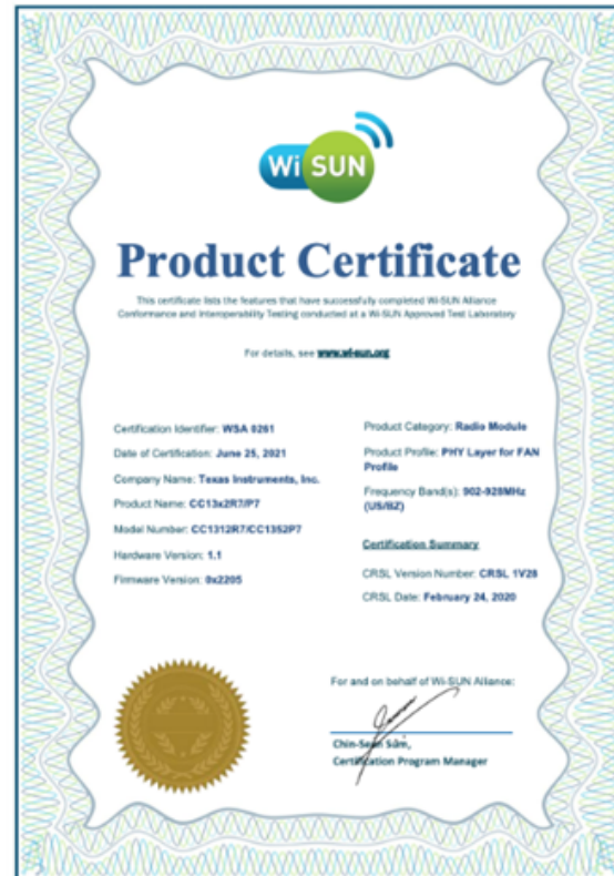
WSA0260 – Texas Instruments CC13x2R/P WSA0261 – Texas Instruments CC13x2R7/P7 WSA0262 – Texas Instruments CC13x2R/P WSA0263 – Texas Instruments CC13x2R7/P7

Addressing these four questions will help you save development cost and get to market faster with a more streamlined design cycle for your IoT application.