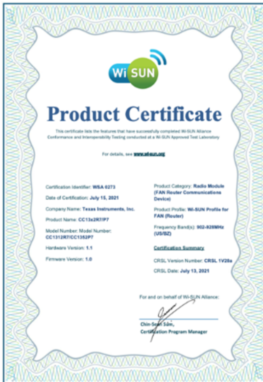
WSA0272 – Texas Instruments CC13x2R/P WSA0273 – Texas Instruments CC13x2R7/P7

Wi-SUN Certified™ is a seal of approval for products indicating that they have met industry-agreed standards for conformance and interoperability for one or more of the Wi-SUN Alliance profiles.