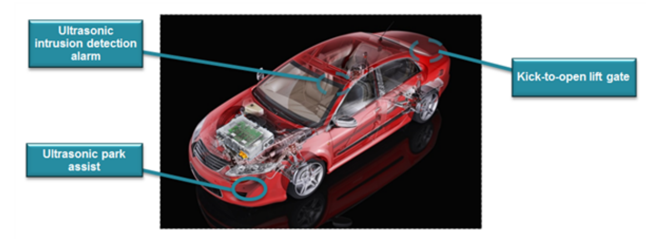
Figure 1. Ultrasonic Sensors in Passenger Vehicles

Ultrasonic sensors have been used in passenger vehicles for many years in applications like ultrasonic park assist, which help vehicles detect objects at low speeds when parking. However, kick-to-open liftgates and intrusion detection alarms are two other emerging applications for ultrasonic sensors; see Figure 1. In this post, I will explain why – and how – all three applications use ultrasonic sensors.