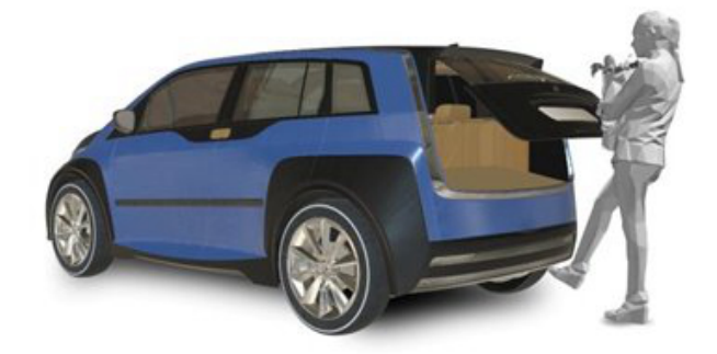
Figure 3. Kick-to-open Lift Gate

A kick-to-open liftgate is also known as a smart trunk opener. This feature enables vehicle owners to place their foot under the back bumper in a kicking motion to open the trunk of the vehicle without using their hands, as shown in Figure 3.