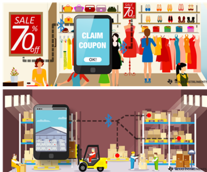
Figure 2. Enterprise and industrial applications such as retail beacons and asset tracking

provides a new level of control to users and enables them to avoid from being tracked by unknown or untrusted devices. The enhanced privacy feature of Bluetooth 4.2 allows Bluetooth accessories share their unique address with only trusted devices while reducing power consumption by blocking inquiries from other devices. This prevents potential invasion of privacy for users and allows location and asset tracking applications to be more trustworthy and user-friendly.