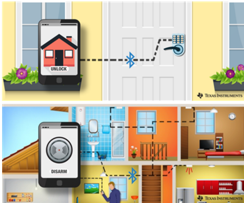
Figure 1. Building automation applications including smart door locks and smoke detectors