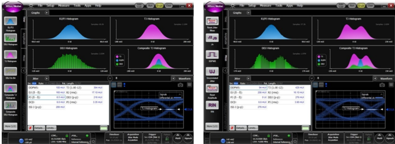
Figure 2. Jitter Decomposition of Properly Tuned versus Over-equalized Eye Diagrams

Using the jitter decomposition function of an oscilloscope, you can see in Figure 2 how the over-equalized eye shows bimodal jitter content. In other words, the jitter distribution is on two frequencies that average out to the data rate rather than the actual data rate itself. Further examination shows that this bimodal jitter distribution is associated with data-dependent jitter, which is directly impacted by the amount of equalization applied by the equalizer.