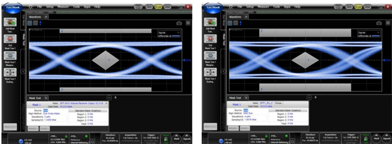
Figure 1. Properly Tuned versus Over-equalized Eye Diagrams

Figure 1 shows two example eye diagrams. One eye diagram is properly tuned for the channel (left), while the other shows signs of over-equalization (right).