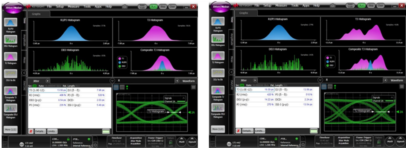
Figure 3. Alternate Presentation of Over-equalization – Double Banding with Overshoot

When tuning or optimizing links for best performance, keep in mind both the horizontal and vertical eye opening. It is easy to maximize for one or the other, but be sure to avoid over-equalizing the signal, as that may increase the bit error rate. In my next installment, I'll be discussing reflections – what are they, and how engineers can mitigate their effects in their high-speed systems. Subscribe to Analog Wire to receive an email notification upon the publication of the second post.