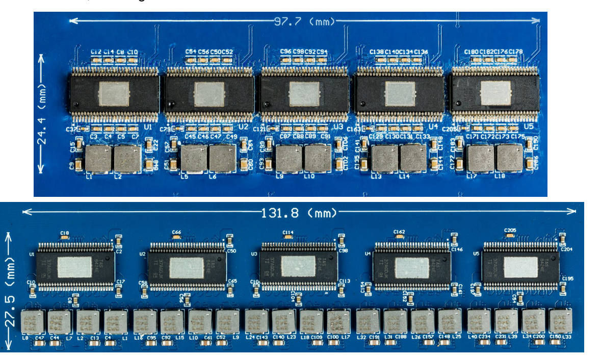
Figure 2. A 20-channel automotive audio system design featuring five TAS6754-Q1 Class-D amplifiers compared to Tl's TAS6424E-Q1 Class-D amplifiers

An obvious concern for system architects would be how easy it is to implement this amplifier. Our 1L modulation technology is meant to incorporate into systems seamlessly. With 1L modulation, TI created a modulation scheme that fits into the amplifier in such a way that designers can reap all of the benefits without introducing significant design challenges, while still maintaining high-quality Class-D audio performance.