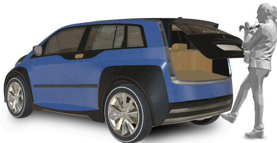
Figure 3. Kick-to-open gesture for car access.

The deployment of passive entry systems based on a kick-to-open gesture, as illustrated in Figure 3 are