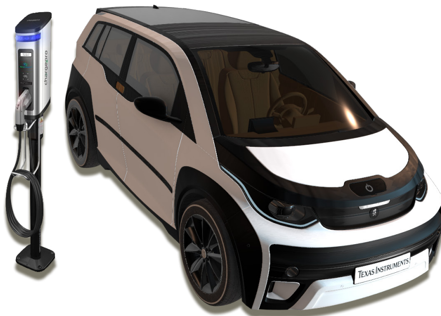
Figure 4. Growing prevalence of the electric vehicle and the connected car.

The growing prevalence of electric vehicles (EVs), including hybrid EVs (HEVs), conceptually illustrated in Figure 4 , bring a corresponding increase in the electrical architecture of body electronics systems.