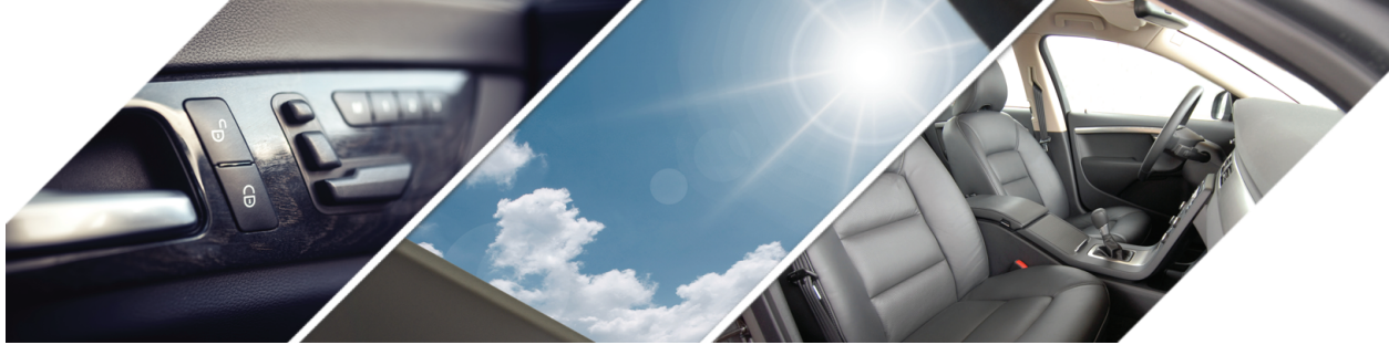
Figure 2. Power seat controls, sunroof and power seats.

Furthermore, some window systems incorporate an anti-pinch feature to detect obstructions while the window is closing and automatically opens the window.