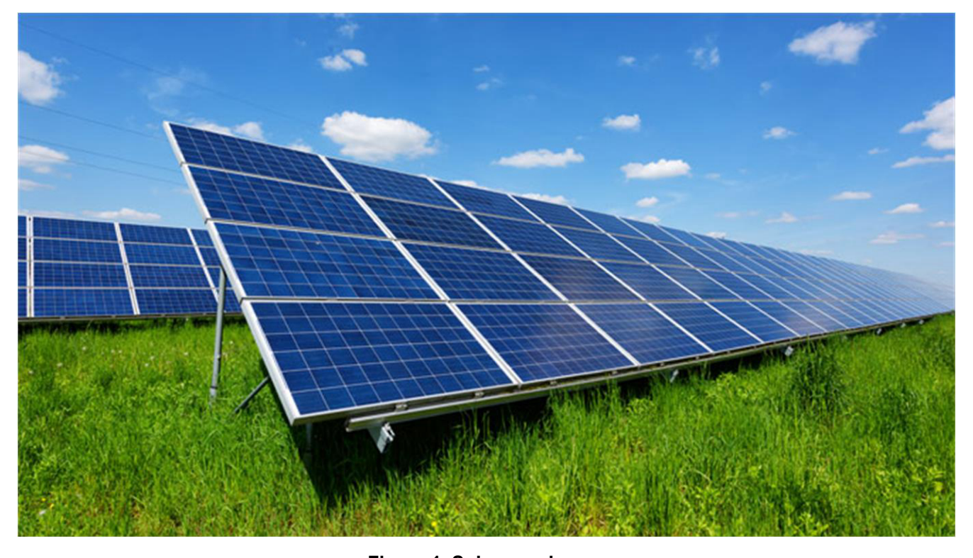
Figure 1. Solar panel array

But even though AI in real-time control systems for motor drives, solar energy (as shown in Figure 1) and battery-management applications won't garner the same number of headlines as a new large language model, the use of edge AI for fault detection can significantly affect system efficiency, safety and productivity.